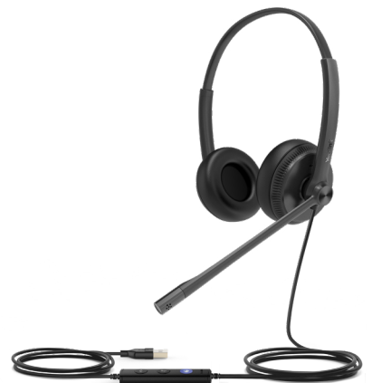
UH34/UH34 Lite Dual Teams UH34/UH34 Lite Dual UC