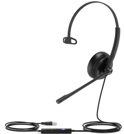
UH34/UH34 Lite Mono Teams UH34/UH34 Lite Mono UC

The hand-held controller with LED indicator provides easier access to key call control capabilities, including answer call, end call, reject call, and mute/unmute.